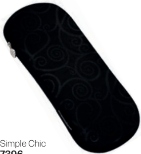
Simple Chic 7396