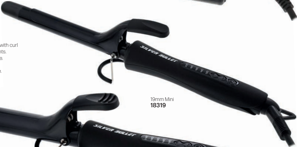
19mm Mini 18319