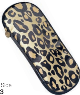
Wild Side 7393