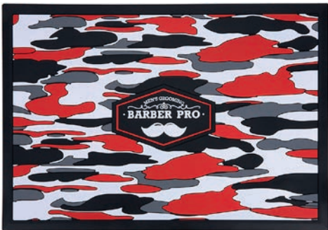
Barber Mat 48 x 33cm, 3mm thickness 18107