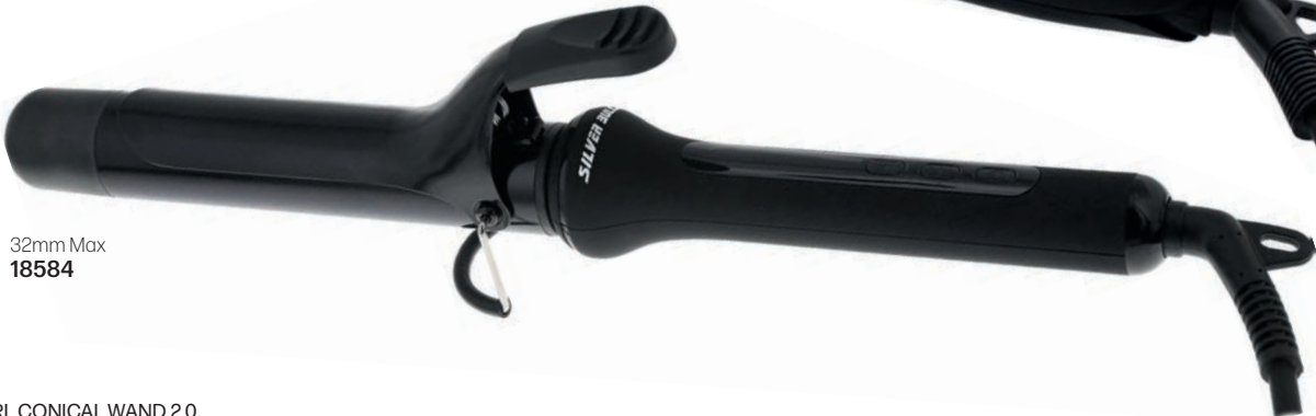
32mm Max 18584