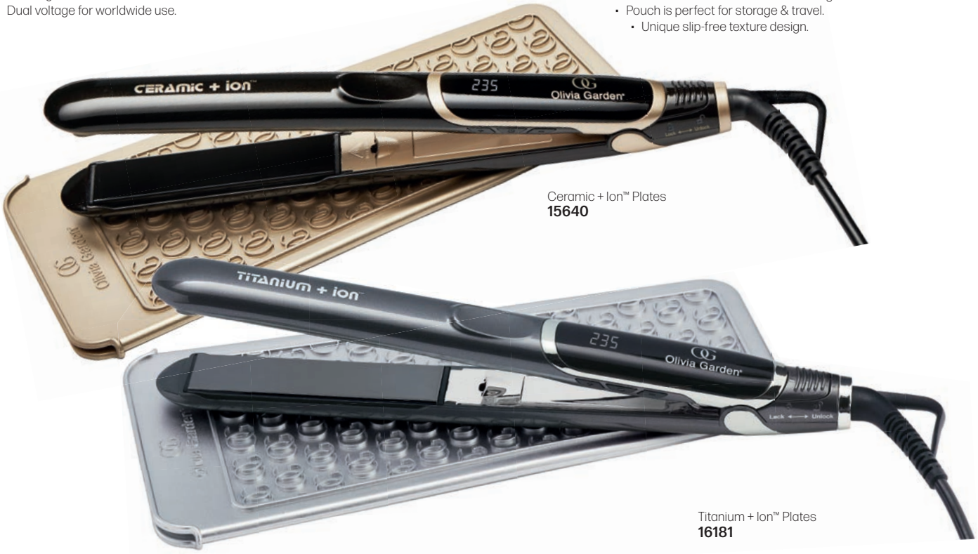
Ceramic + Ion™ Plates 15640