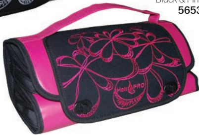
Black & Pink 5653