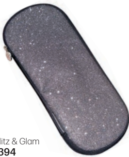
Glitz & Glam 7394