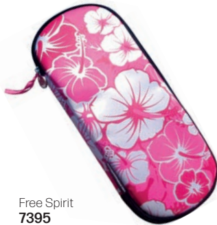
Free Spirit 7395