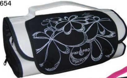
Stitched Bag for Straighteners & Tongs, 33cm, Empty Black & White 5654