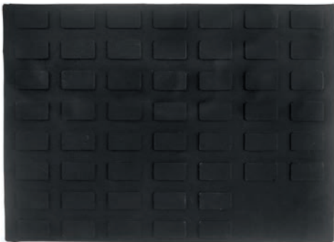
Silicone Heat-Resistant Mat for Hot Tools, Small Black 15934