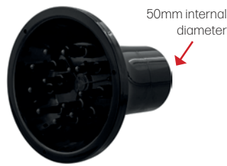
PIK Universal Diffuser 4401