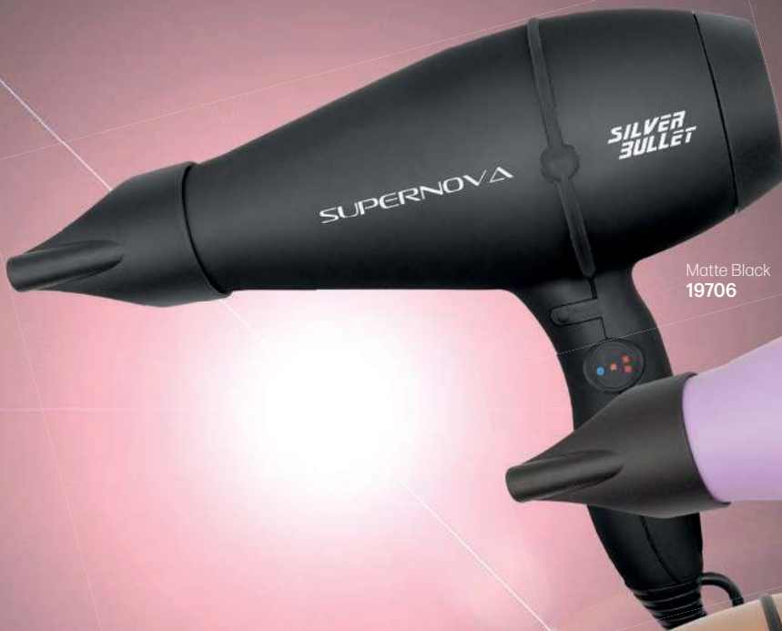
Matte Black 19706