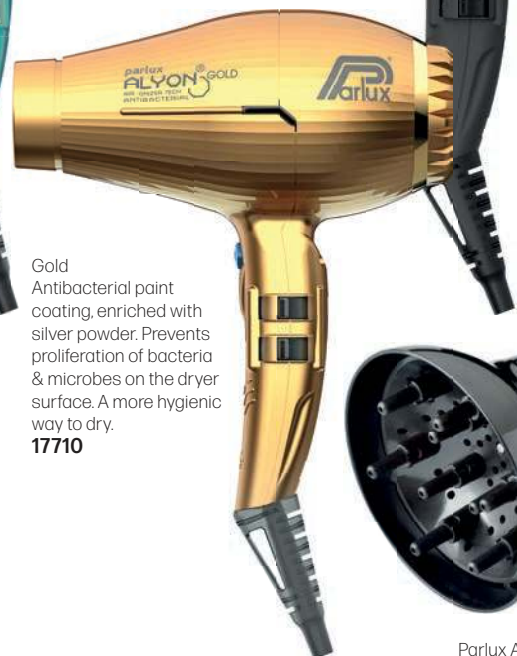
Gold Antibacterial paint coating, enriched with silver powder. Prevents proliferation of bacteria & microbes on the dryer surface. A more hygienic way to dry. 17710