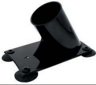
Plastic Dryer Holder with Suction Cups 1145