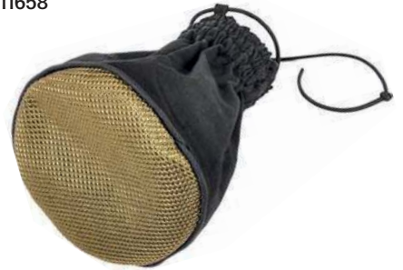
Hot Sock Diffuser 11658