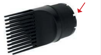
Smart Universal Dryer Comb with Silicone Nozzle Perfect for thick hair. 11062