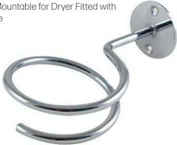
Wall Mountable for Dryer Fitted with Nozzle 3749