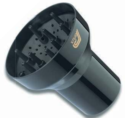
Diffuser for 3200 PLUS 15630