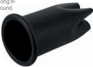
Straightener & Tong In-Bench Holder, Round, Black, 5cm Diameter 3276