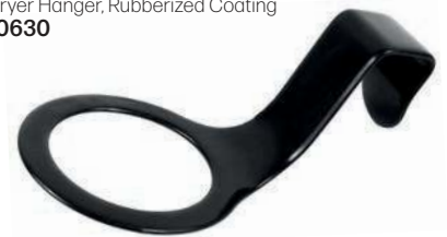
Dryer Hanger, Rubberized Coating 10630