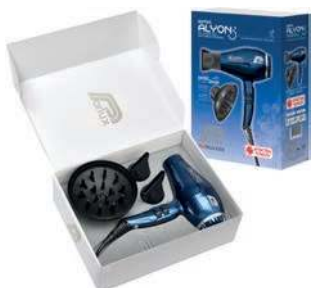
Night Blue Antibacterial paint coating, enriched with silver powder that prevents the proliferation of bacteria & microbes on the dryer surface. A more hygienic way to dry. 16608