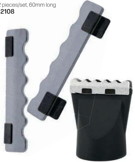
Slimline Nozzle Attachment Clips on any nozzle for any dryer, in order to direct the heat onto the hair. For smoother blow-drying. NB: nozzle not included. 2 pieces/set, 60mm long 12108