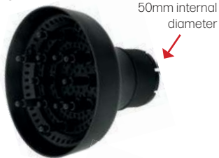
Smart Universal Diffuser with Silicone Nozzle 11327