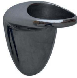
Wall Mounted Hair Dryer Holders Brushed Aluminium 4576