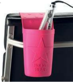
Hot Iron & Tong Holster, Hot Pink A professional heat-resistant silicone holder for hot styling tools - designed for the professional stylist. Heat-resistant to 260°C. 8976