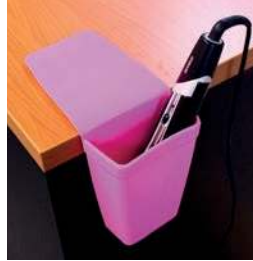
Holster for Retail & Home Use Hot Pink 9053 Purple 9054