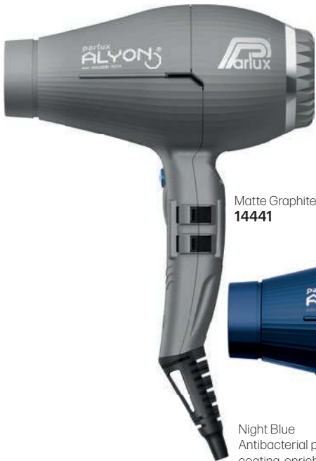
Matte Graphite 14441