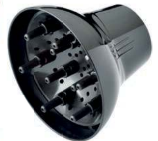
Parlux Alyon Diffuser 14634