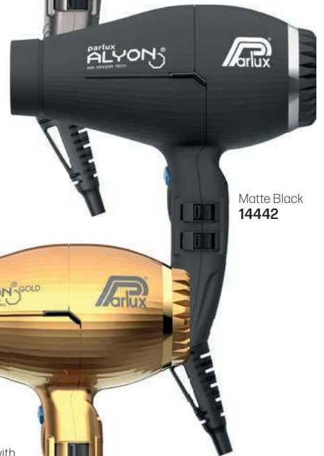
Matte Black 14442