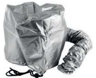
Bonnet Attachment for all Hair Dryers 9374