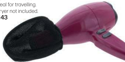
Soft Mitt Diffuser Ideal for travelling. Dryer not included. 1143