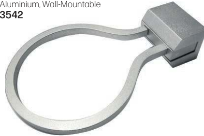
Aluminium, Wall-Mountable 3542