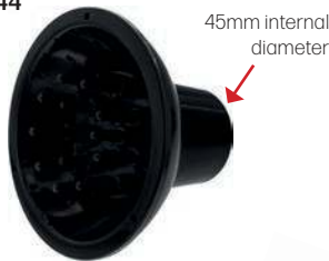
Universal Diffuser Fits most dryers. 1144