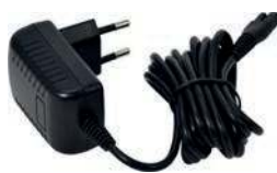
Adaptor Plug 18526