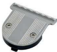
T-Blade Cutting Head 18525