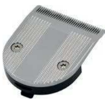
Cutting Head 18524