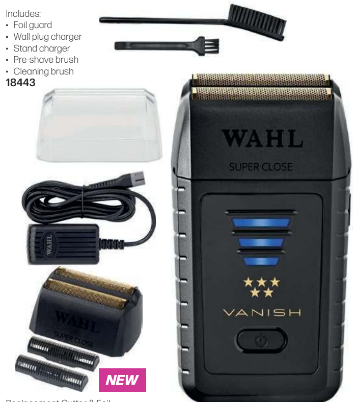
Replacement Cutter & Foil 20056