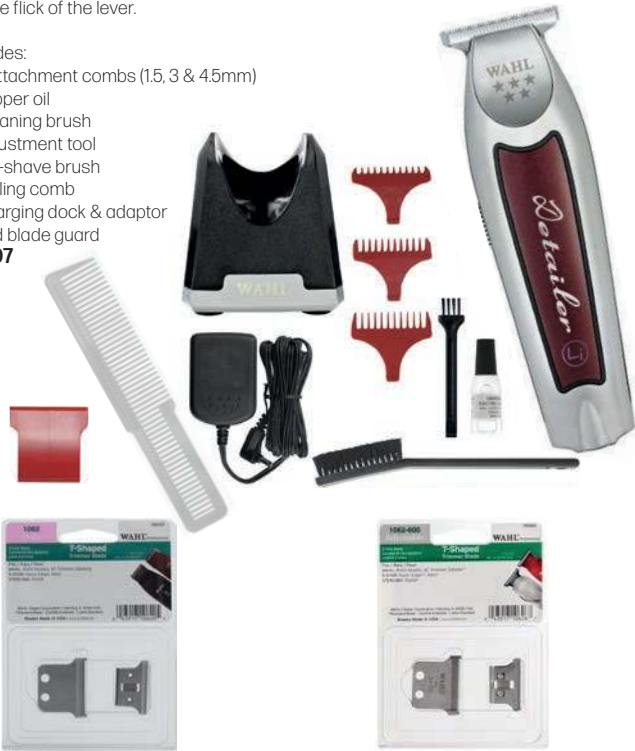
Wahl Detailer Trimmer Blade Set T-Shaped 16330