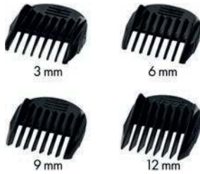
Spare Attachment Comb Set 18530