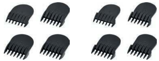
Spare Attachment Comb Set 18527