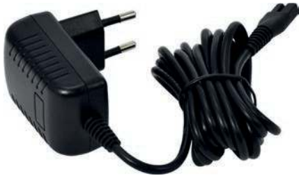
Adaptor Plug 18526