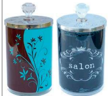
Split Personality 6609

Designer Sterilizing Jar, Mid-Size 600ml