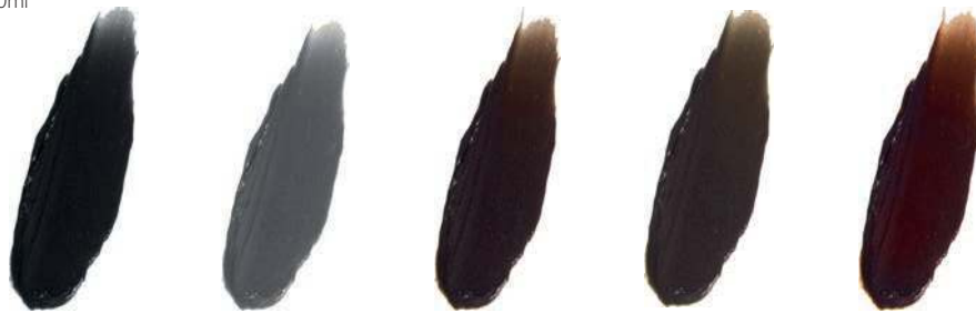
Black #1 19079

Created for the salon professional, the new & improved Apraise lash & brow tint is 100% vegan & PPD free. Offers higher shine, better coverage & stronger staining power. The water-resistant, smudge-proof formula lasts up to 8 weeks & visibly transforms the appearance of lashes & brows, achieving the perfect shade every time. 20ml