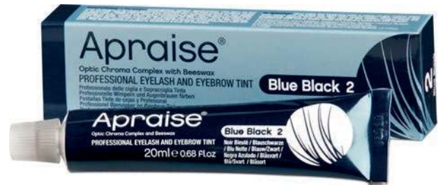
Blue Black 10562