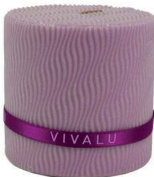
Red Rice & Bio Cartam Oil in Coconut & Shea Butter Mousse, will take your senses to a tranquil place of relaxation & meditation. 11457