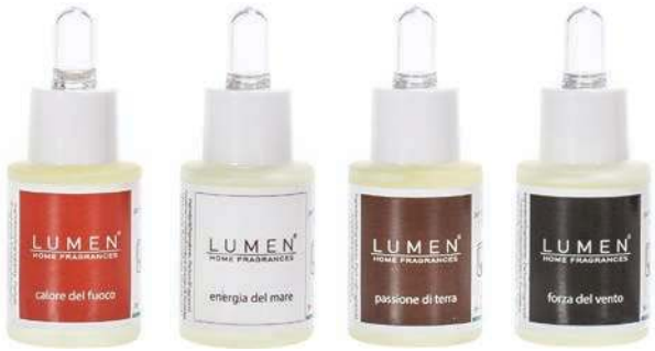
Fire (Red) 16137 Sea (White) 16138 Earth (Brown) 16139 Wind (Black) 16140

Glass Sphere, Large, 16cm For candles (32 hour) 10875