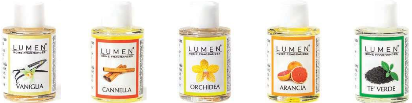
Vanilla 10876 Cinnamon 10877 Orchid 10878 Orange 10879 Green Tea 10880