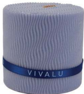
Blue Macadamia, Jojoba Oil & Soy Butter, this candle gives your senses the feeling of water & earth around you. When used in a massage you are revived & confident. 11456

These candles are rich in nutrients for skin, & are made fluid & useable by the lit flame. In addition to the natural moisturizing action of the oils, the perfume contained in the formula plays an aromatherapy role of balance.