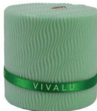
Green Juniper, Thyme, Benzoin & Cloves essential oils make up a natural, earthy candle which leaves you fresh after a relaxing massage. 11458