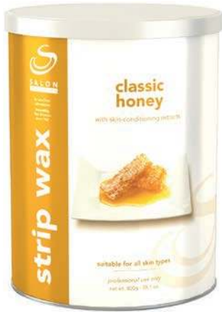
Classic Honey 2793

Extremely quick method of hair removal, removes even the shortest hairs, applied thinly with direction of hair & removed with strip in opposite direction. 800g