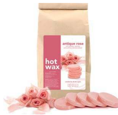
Antique Rose With beeswax, rosemary & soothing calendula extract. 1kg (disks) 18404