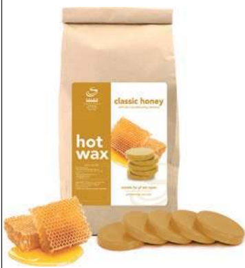
Classic Honey With skin-conditioning extracts. 1kg (disks) 18402

Especially suited to removing short, stubborn hairs, ideal for bikini, underarm & facial areas. Wax is applied against hair growth & peeled off in opposite direction.