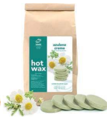
Azulene Crème Specially suited for removing short, stubborn hairs. Ideal for bikini, underarm & facial areas. 1kg (disks) 18403