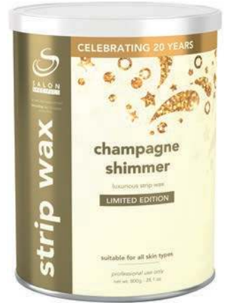
Champagne Shimmer 14674