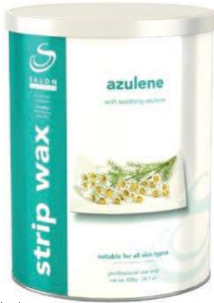
Azulene Odor-free, soothing for sensitive skins & first time waxers. 2795