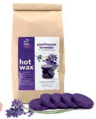
Pearlescent Lavender With beeswax & harmonizing lavender oil. 1kg (disks) 18405