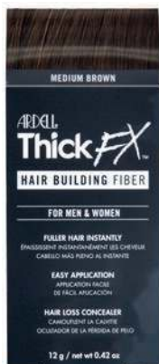
Medium Brown 12980