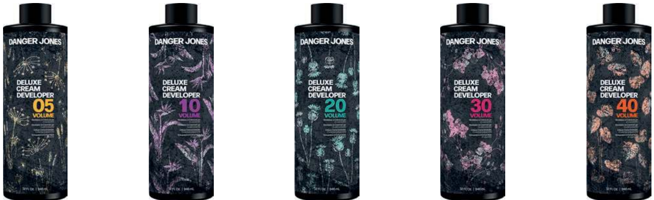
5 Volume 19484

Deluxe Cream Developer Creamy consistency & active ingredients of Jojoba Seed Oil & Aloe Leaf Juice help provide extra moisture when mixed. Specifically designed to pair with Danger Jones Powder Lightener & Color Remover. 100% vegan & gluten free. No animal testing. 946ml